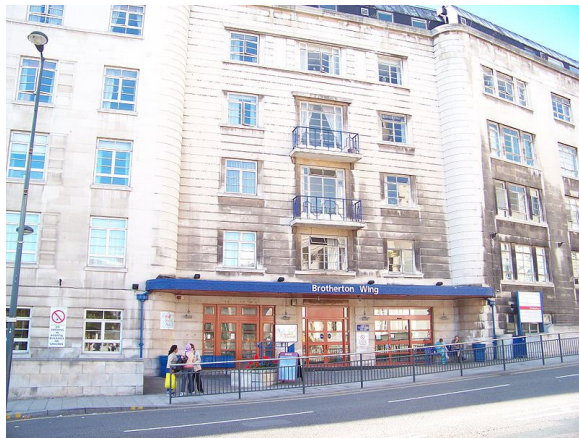
Leeds General Infirmary – Brotherton Wing

We received and discussed in some detail a number of briefing papers which identified key issues and priorities for NHS Leeds, Leeds Partnerships NHS Foundation Trust, and Leeds Teaching Hospitals NHS Trust. Initially helping us to develop our own work programme, we have also focused on local priorities through the established quarterly monitoring arrangements.